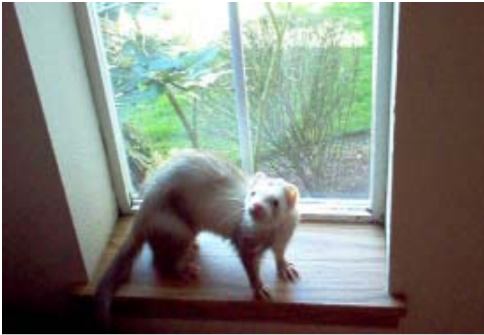
Puck in Window